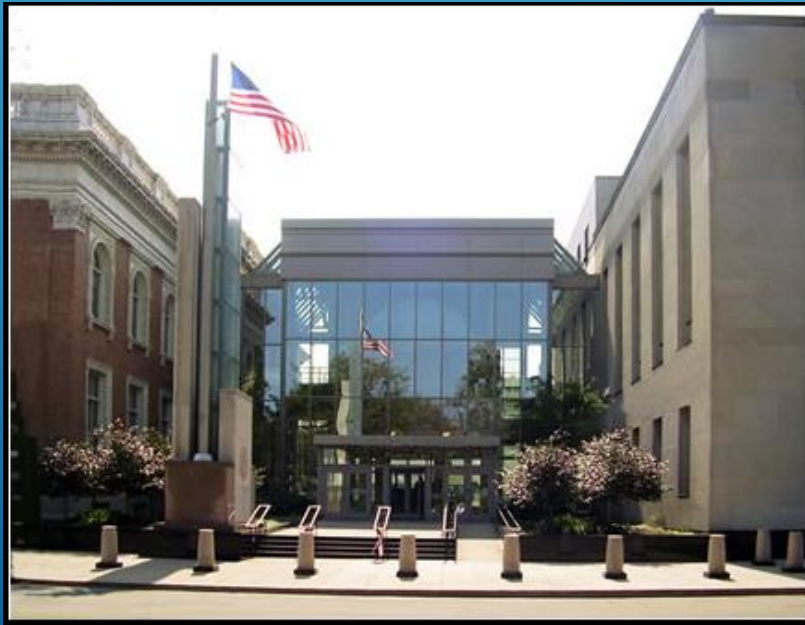
Main entrance into the complex.