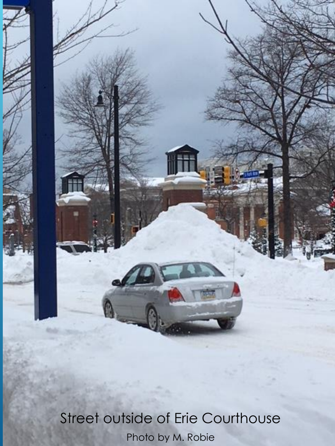
Street outside of Erie Courthouse