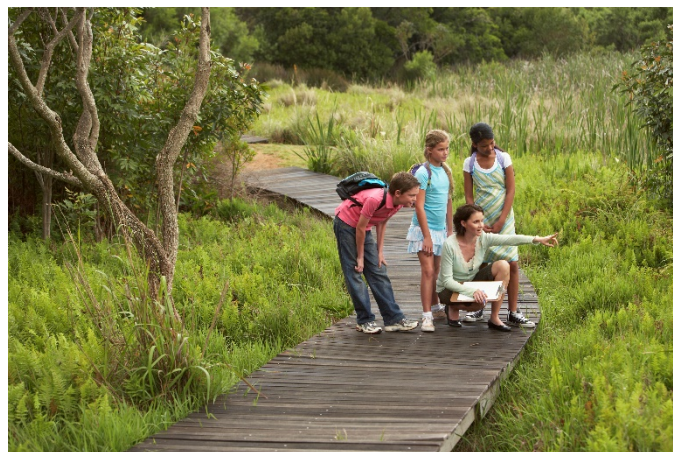
A teacher and students on an elevated path in a marshland.

A mixed-use community called Abacoa in Jupiter, Florida, puts many smart growth principles into action, including cluster design and land preservation. The community encompasses 2,055 acres, including 393 acres preserved for open space and another 260 acres reserved for green space. Local ordinances and mixed-use cluster development make this protection of open space possible. The community and surrounding landscape focus on protecting wildlife habitat and riparian buffers, including native pine woods, wetlands and habitat for the endangered gopher tortoise. Abacoa's natural features also provide stormwater management benefits by reducing stormwater discharge through natural infiltration and providing water quality treatment in streams, lakes and wetlands.