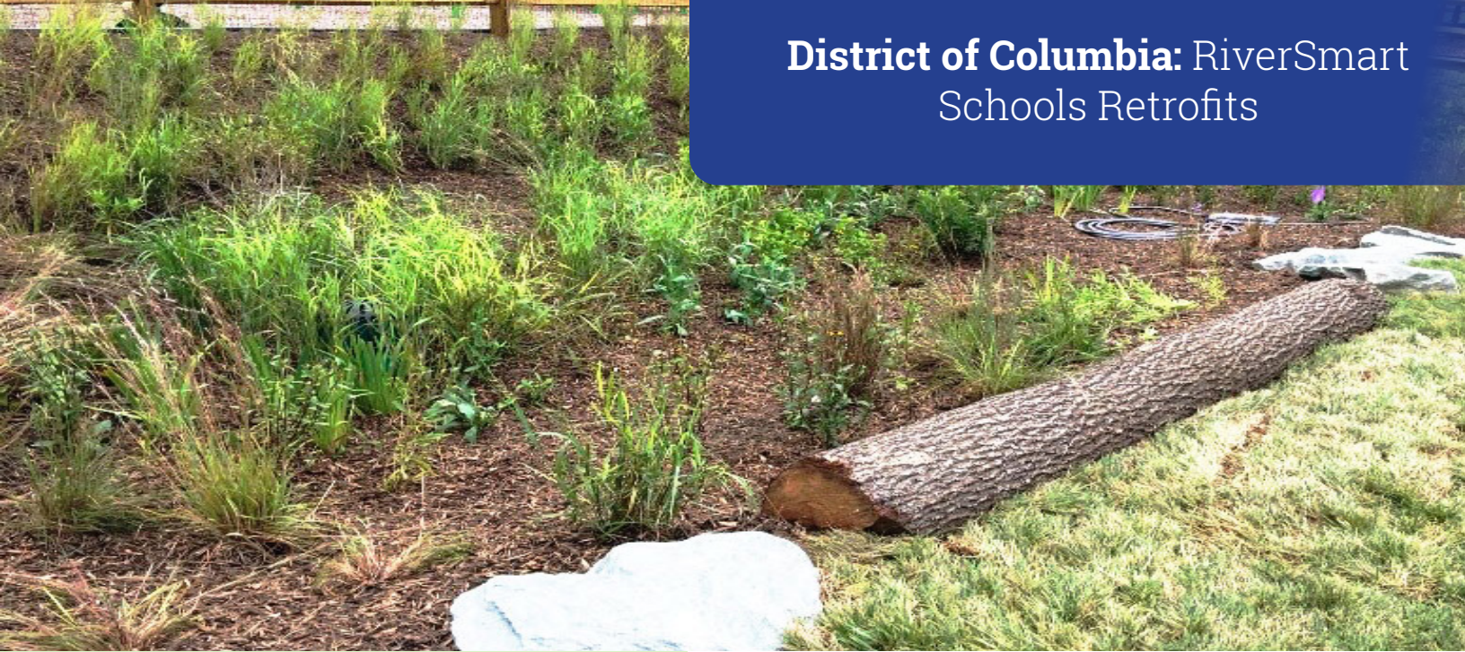
Friendship Public Charter School-Woodridge: Bioretention

The District's Department of Energy and Environment (DOEE) RiverSmart Schools program used Construction Grants funds to retrofit 15 public and charter schoolyards to date.