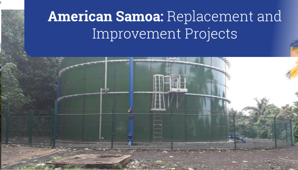
Upper Pago Water Improvement Project (left) and Upper Amouli Water Storage Tank Project (right)

American Samoa became a U.S. territory by deed of Accession in 1900. The tuna canning industry is a major employer. The per capita income of American Samoa is only $8,000, by far the lowest in the United States. American Samoa faces significant environmental and public health challenges including inadequate indoor plumbing and water pollution due to heavy metals in portions of Pago Pago Harbor. American Samoa continues to make progress in addressing these challenges.