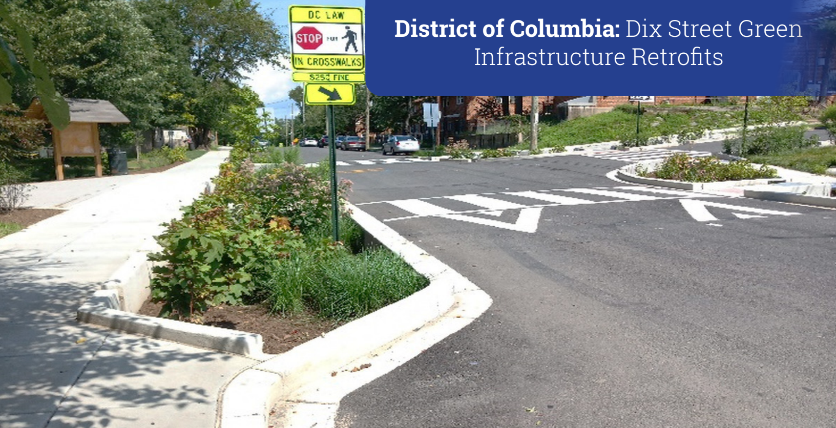
Bioretention Bulbouts at Intersection of 53rd and Dix Streets NE

This District Department of Transportation (DDOT) project retrofitted three blocks of Dix Street NE in the Deanwood neighborhood with 12 green infrastructure best management practices: bioretention areas in curb bulbouts, trees, and permeable pavers. Dix Street NE is an urban, residential street that parallels the south bank of Watts Branch, D.C.'s largest non-tidal tributary to the Anacostia River and D.C.'s priority stream in a disadvantaged community.