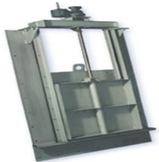
Figtree Pumpstation New Sluice Gate