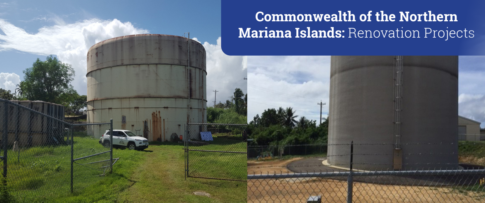
NMC Old (left) and New Water Tank (right), As Lito, Distribution Upgrades/Service Lateral Replacement Project

C NMI is a 300-mile archipelago consisting of 14 islands, with a total land area of 183.5 square miles. The principal inhabited islands are Saipan, Rota, and Tinian.