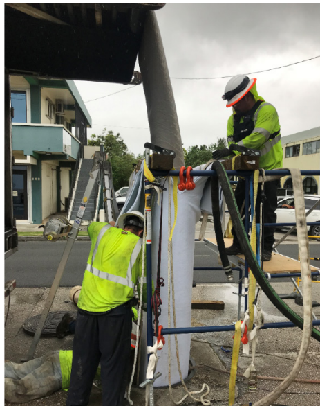
Installing CIPP Liner for Rt. 4 Sewer Rehab on Guam

The design/build project included hydrogeologic investigations to determine the viability of each well's rehabilitation. All five wells received the go ahead and received a full renovation. The project was initiated on August 19, 2016 and completed on September 20, 2019 at a cost of $7.28 million.