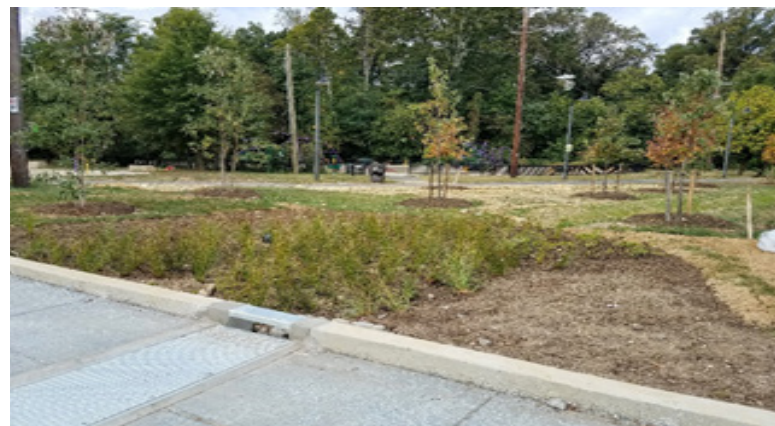
Bioretention Basin and New Tree Plantings at Deane and Division Avenues NE, Formerly a Stub Street with Jersey Barriers

In total, the project resulted in managing approximately 74,000 gallons of stormwater from a 116,000 square foot contributing drainage area during a 1.2" storm event, removed nearly 13,000 square feet of impervious surface, and added 38 new trees to the urban neighborhood's canopy. All work was completed by December 2019.