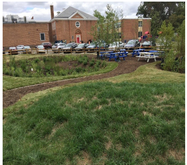
Bunker Hill Elementary School: Bioretention Basin and Outdoor Classroom

In total, the project resulted in these three urban school sites retaining and treating approximately 27,900 gallons of stormwater from a 1.2" rainfall event from a contributing drainage area of about 65,000 square feet through GI that includes 3 outdoor classrooms, 15 trees, 3 bioretention areas, a bioswale, a rainwater cistern, planter boxes, and numerous other vegetation.