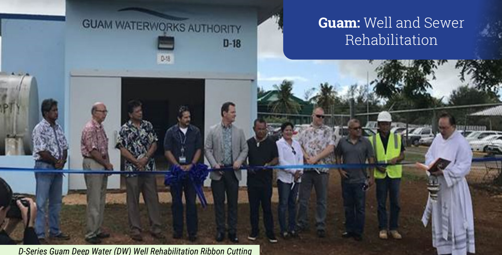
D-Series Guam Deep Water (DW) Well Rehabilitation Ribbon Cutting