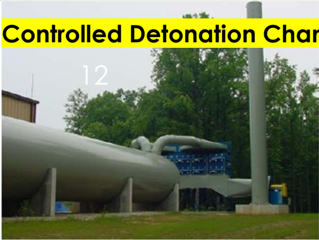
Controlled Detonation Chamber