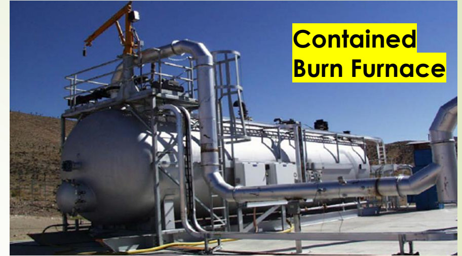
Contained Burn Furnace