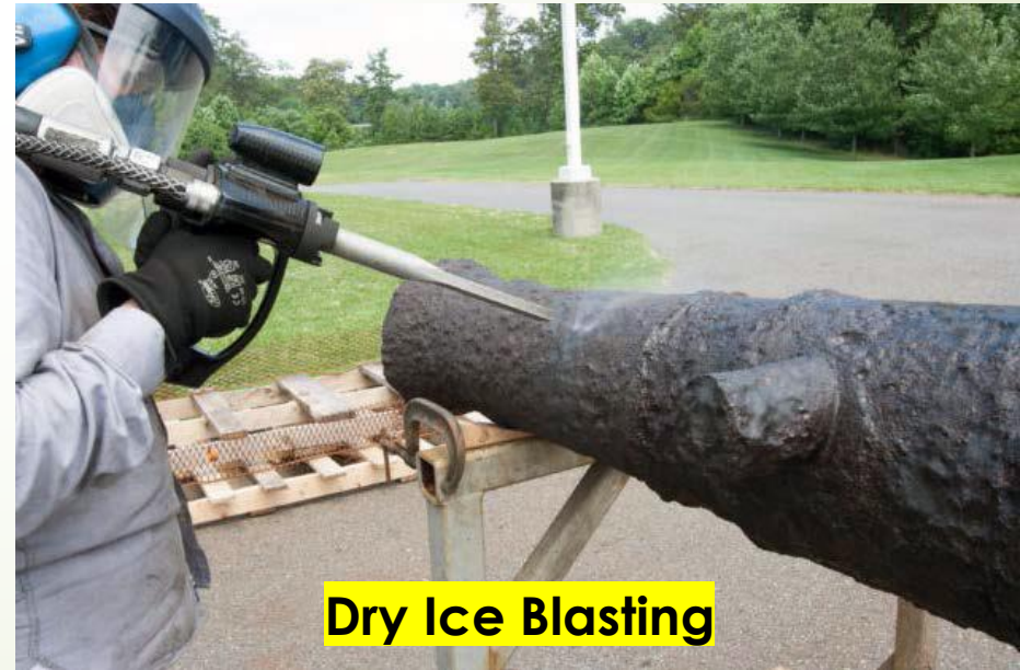
Dry Ice Blasting