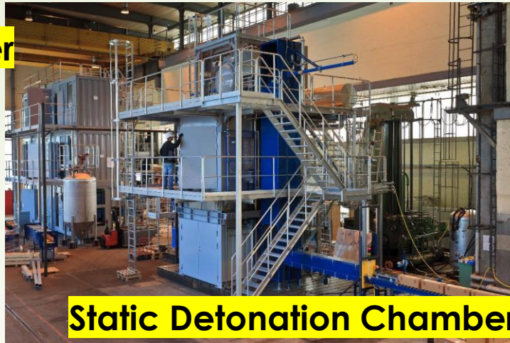
Static Detonation Chamber