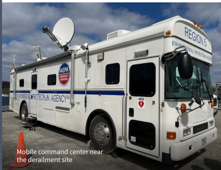
Mobile command center near the derailment site