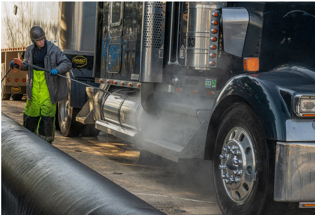
Trucks undergoing cleaning as they leave the derailment site

Soil samples were taken at the park and EPA recently notified the city of these results. The results were all below background and screening levels. Contact with water and dirt from Sulphur and Leslie Run should still be avoided as sampling and air sparging continues.