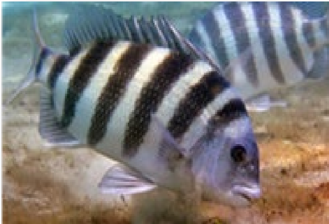
Figure 3. Archosargus probatocephalus (Sheepshead). A popular fish species among recreational and subsistence anglers that is commonly found in the Pensacola and Perdido Bays.