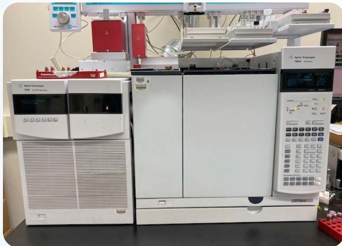
Figure 2: A gas chromatograph/mass spectrometer.