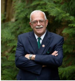
U.S. Rep. Gerry Connolly (VA-11)