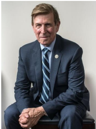
U.S. Rep. Don Beyer (VA-8)