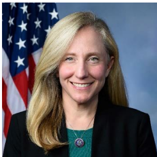
U.S. Rep. Abigail Spanberger (VA-7)