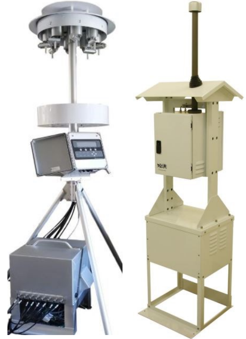
Met One Super SASS