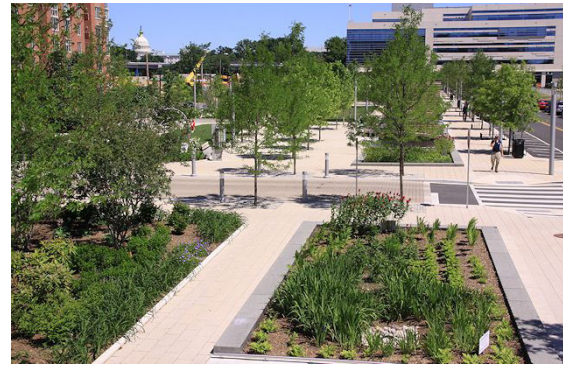
6,000 square feet of linear rain gardens capture stormwater that falls within the Canal Park site for reuse.

In addition to cisterns, tree planters, and bioretention installations, the park includes two interactive water features for an array of 42 programmable water jets and a shallow pool. Captured and treated stormwater is also reused for an ice-skating rink during the winter months. More than 150 trees and hundreds of shrubs and flowers are found within the park, and bioretention