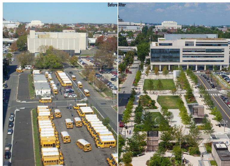
Before and after image of Canal Park. The 3-acre site formerly used as a school bus parking lot was transformed into a multi-use waterfront park.

The Canal Park design incorporated bioretention, tree planters and three pavilions, which were a nod to floating barges once used on the nearby canal. The design also emphasized sustainability, which included water conservation and renewable energy. Because the area had experienced water pollution from combined sewer overflows, capturing stormwater before it enters the sewer system was a top design priority. Today, the innovative stormwater management system captures and treats stormwater from both the park and pavement from nearby sites; the treated stormwater irrigates landscaping, powers