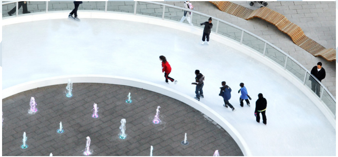
Recycled stormwater is used to create a seasonal ice rink within Canal Park, which serves as a social gathering area during the winter months. Graphic credit: OLIN.